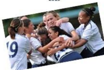
Players wanted for the 2015 – 2016 Season

Tottenham Hotspur Ladies FC - Youth Open Sessions 2015